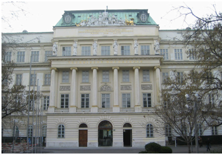
Vienna University of Technology

Besides common joint research projects, it has been the guest research stays of Ukrainian scientists to Vienna that set a particular course in the cooperation. Lecturers of Lvivska Polytechnika are given the opportunity to work on specific research projects that are associated with their immediate field of teaching or research. This is, in most cases, linked to an academic goal such as a habilitation(?) or dissertation.